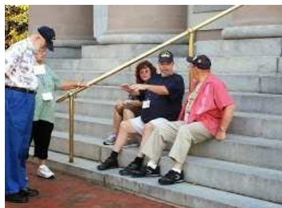
MacArthur Memorial Museum.

Day 2 found us loading buses headed to Norfolk where we spent our first hour touring the